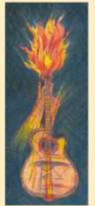
Make your own Version