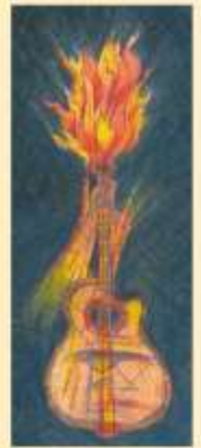
Make your own Version